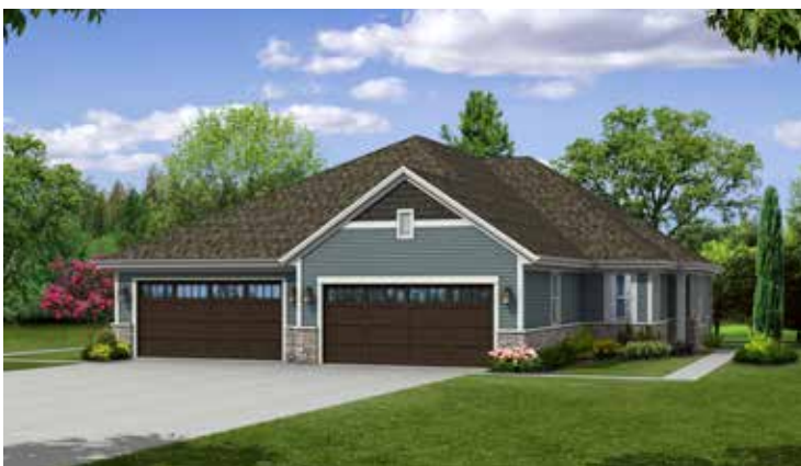
ARTS AND CRAFTS - ENGLISH WEDGEWOOD