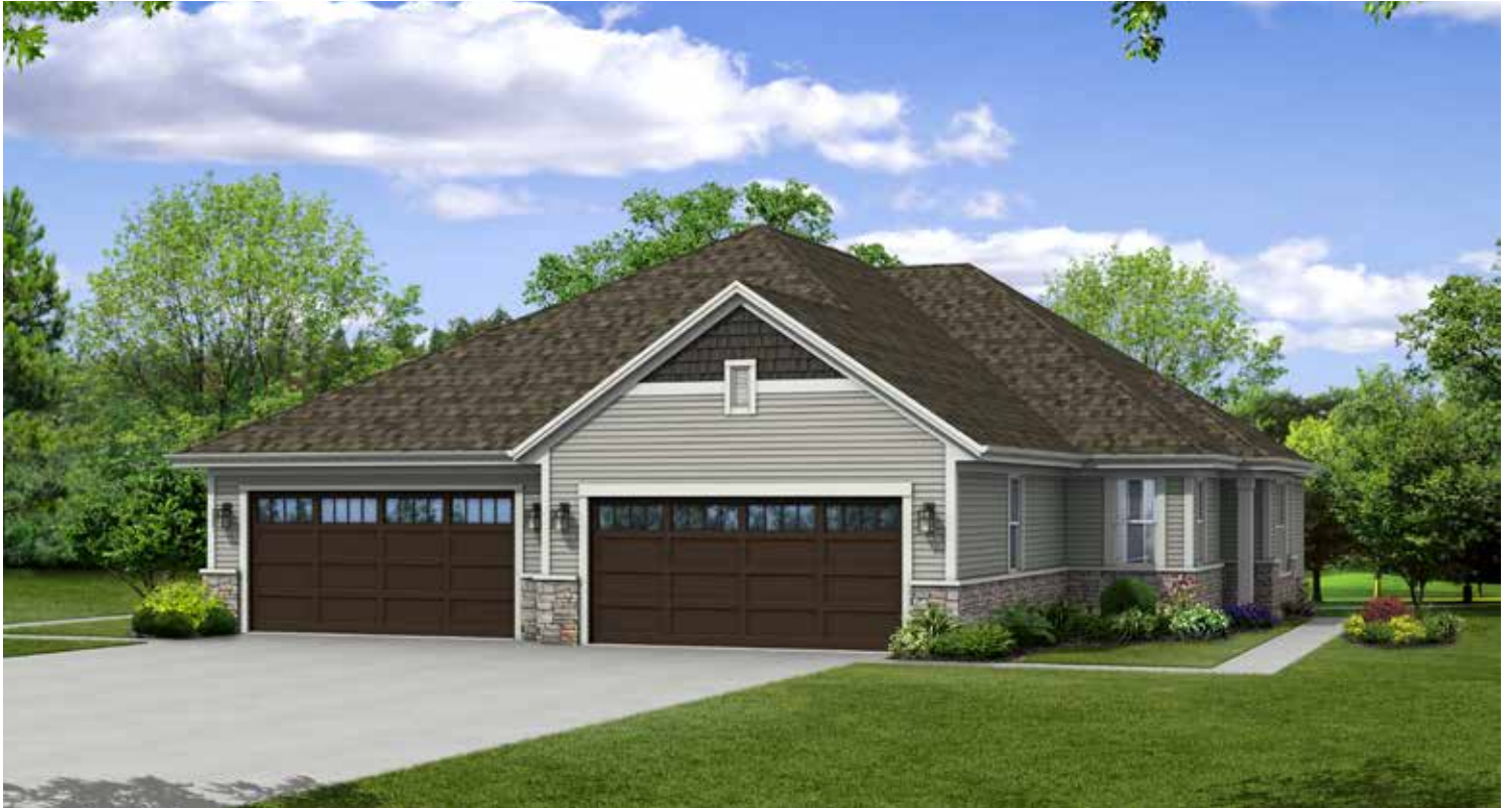
ARTS AND CRAFTS - DESERT SAND

Ranch | 1,412 Sq. Ft. | 2 Bedroom | 2 Bathroom