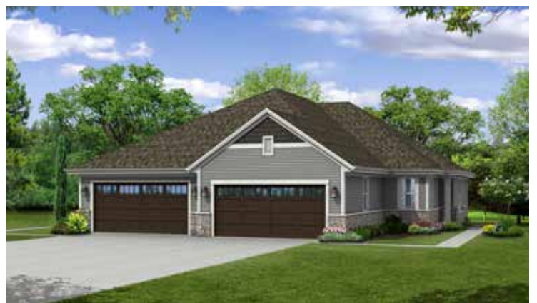
ARTS AND CRAFTS - HARBOR GREY