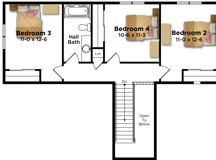
Second Floor 713 Square Feet

1st-Floor Primary | 1,982 Sq. Ft. | 4 Bedroom | 2.5 Bath