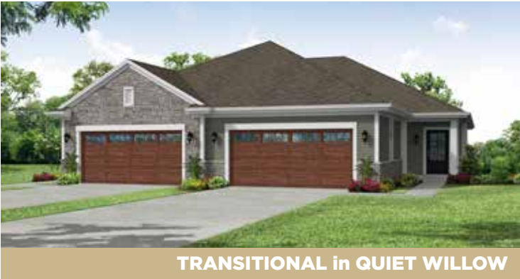
TRANSITIONAL in QUIET WILLOW