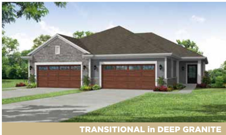
TRANSITIONAL in DEEP GRANITE