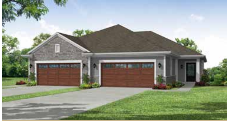
TRANSITIONAL in HARBOR GREY