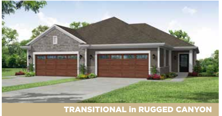
TRANSITIONAL in RUGGED CANYON