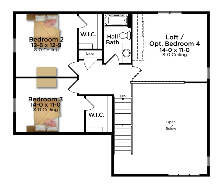
Second Floor 834 Square Feet

1st Floor Primary | 2,200 Sq. Ft. | 3-4 Bedroom | 2.5 Bathroom