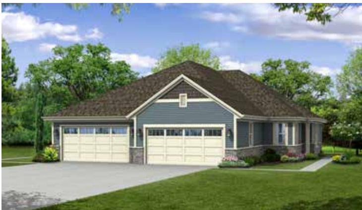
ARTS AND CRAFTS in ENGLISH WEDGEWOOD