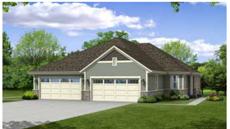
ARTS AND CRAFTS in SCOTTISH THISTLE