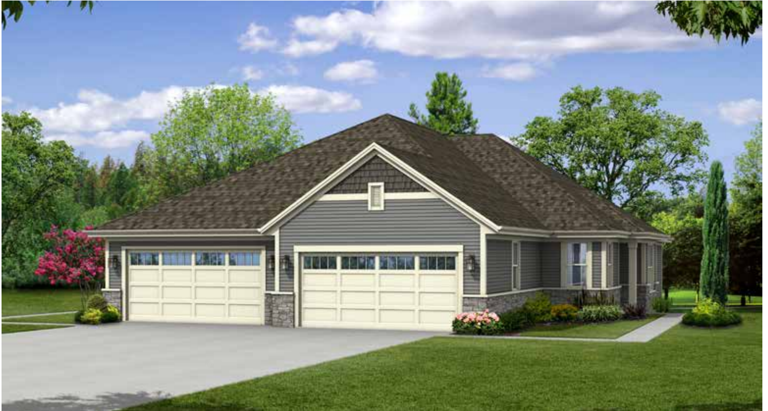
ARTS AND CRAFTS in DEEP GRANITE

Ranch | 1,440 Sq. Ft. | 2 Bedroom | 2 Bathroom