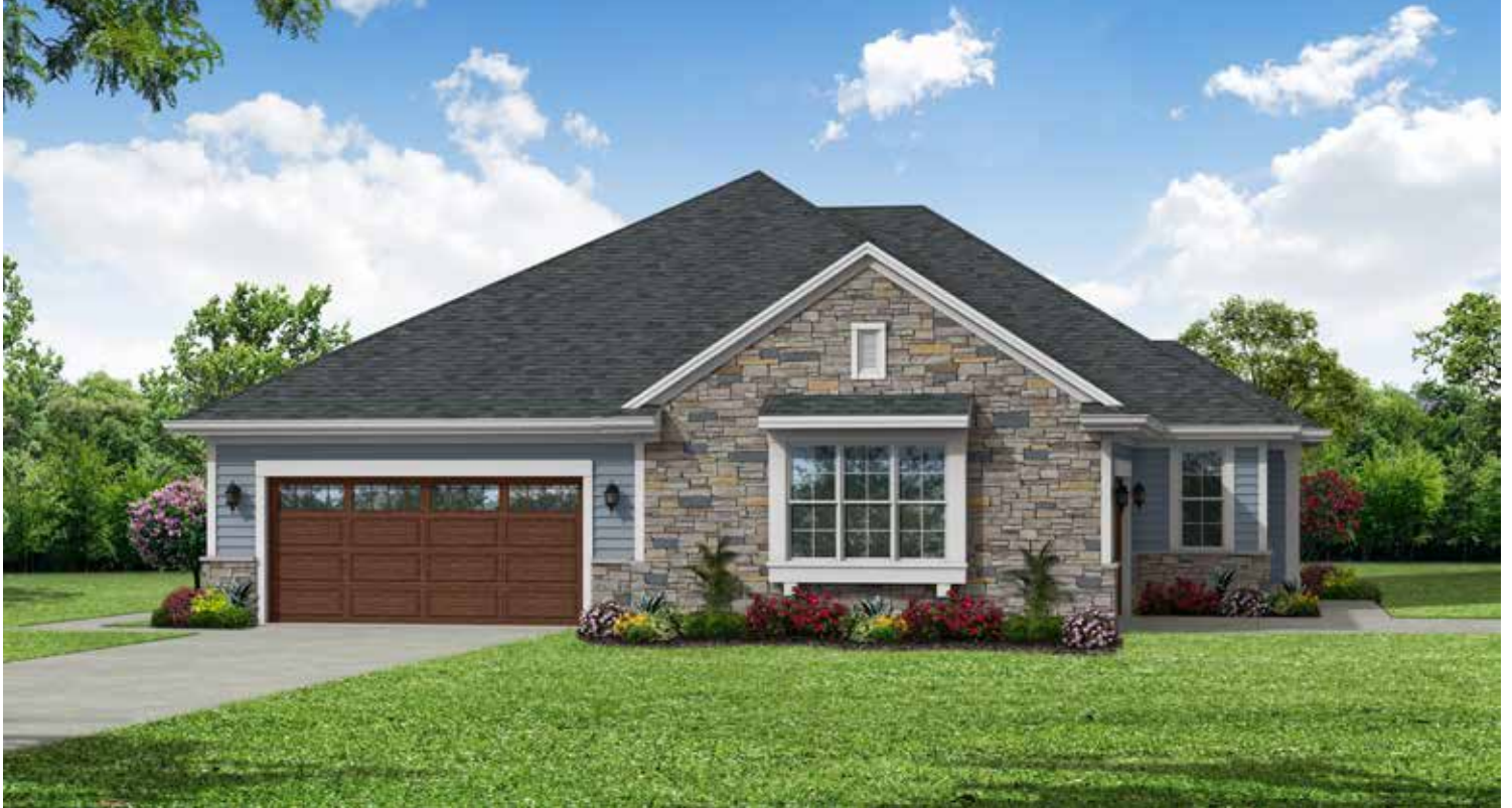
TRANSITIONAL IN BOOTHBAY BLUE

Ranch | 1,600 Sq. Ft. | 2 Bedroom | 2 Bathroom