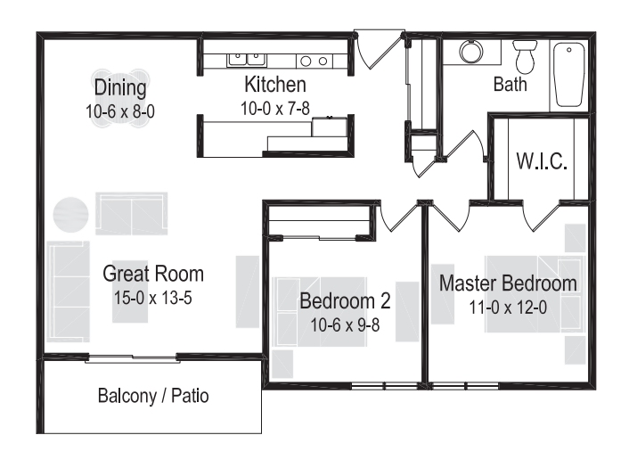
Building 430 2 Bedroom/1 Bath | 900 Sq. Ft