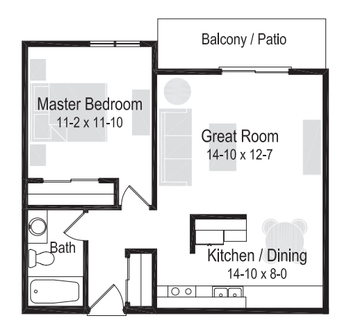
Building 450 1 Bedroom/1 Bath | 625 Sq. Ft