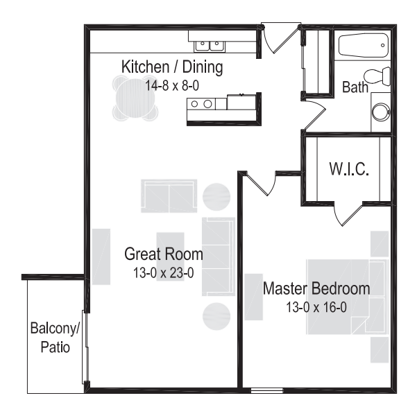
Building 430 1 Bedroom/1 Bath | 880 Sq. Ft