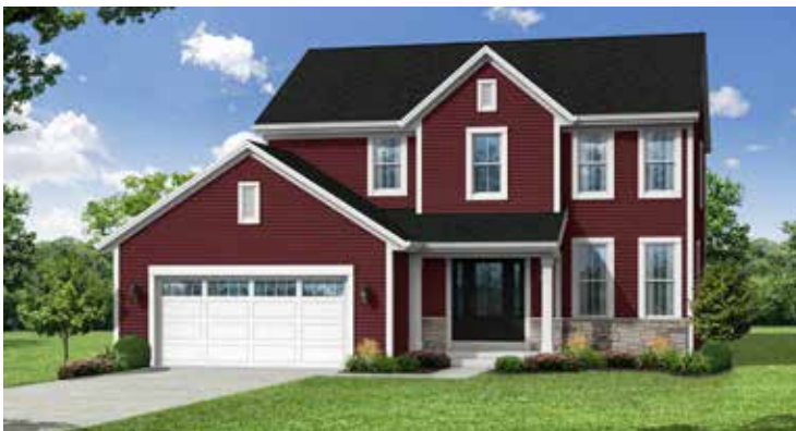
NEW ENGLAND FARMHOUSE