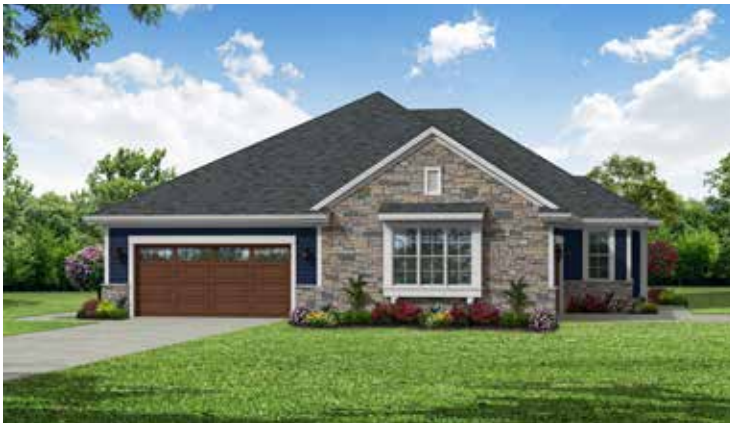
TRANSITIONAL in DEEP OCEAN