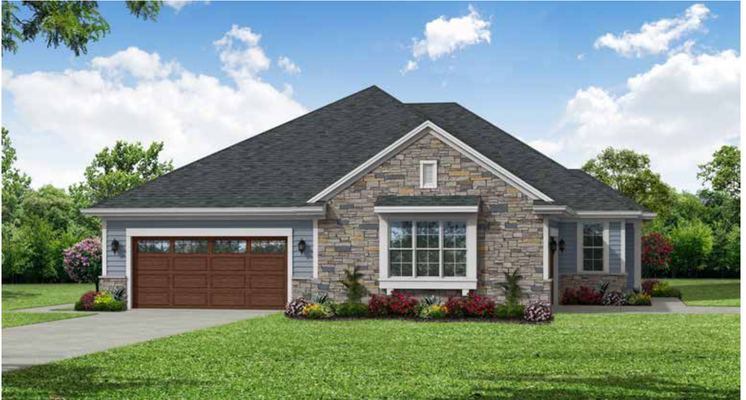
TRANSITIONAL in BOOTHBAY BLUE

Ranch | 1,600 Sq. Ft. | 2 Bedroom | 2 Bathroom