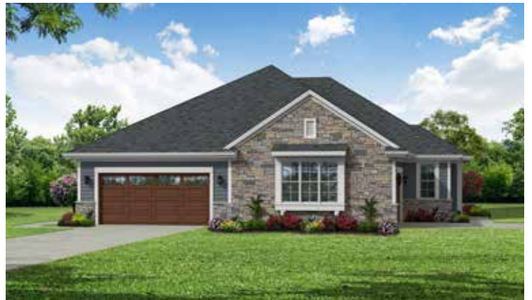
TRANSITIONAL in EVENING BLUE